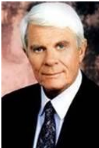
Peter Graves, US Army Air Corps.