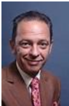
Don Knotts, US Army, Pacific Theater.