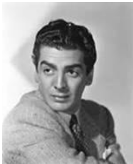
Victor Mature, US Coast Guard.