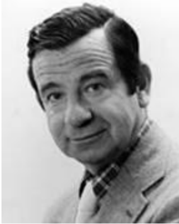
Walter Matthau, US Army Air Corps., B-24 Radioman/Gunner and cryptographer..