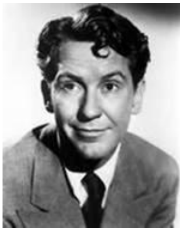
Burgess Meredith, US Army Air Corps.