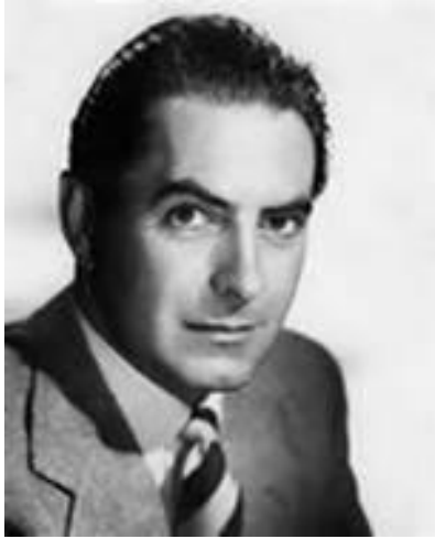
Tyrone Power, US Marines. Transport pilot in the Pacific Theater..