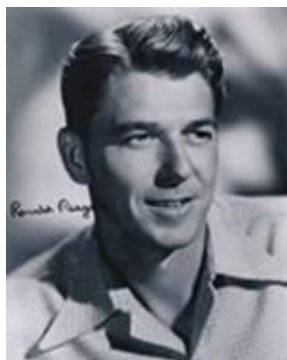
Ronald Reagan. US Army. Was a 2nd Lt. in the Cavalry Reserves before the war. His poor eyesight kept him from being sent overseas with his unit when war came so he transferred to the Army Air Corps Public Relations Unit where he served for the duration.