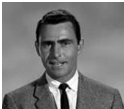
Rod Serling. US Army. 11th Airborne Division in the Pacific. He jumped at Tagaytay in the Philippines and was later wounded in Manila.