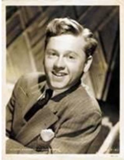
Mickey Rooney, US Army under Patton.. Bronze Star.