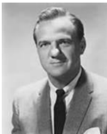
Karl Malden, US Army Air Corps. 8th Air Force, NCO..