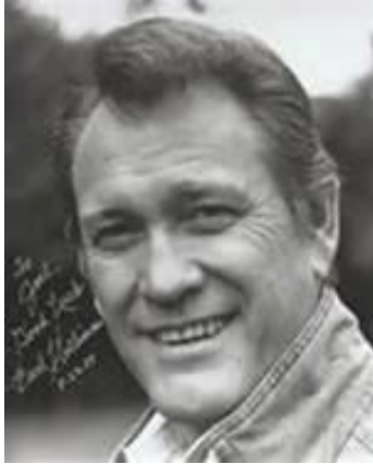
Earl Holliman. US Navy. Lied about his age to enlist. Discharged after a year when they Navy found out.