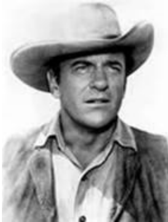
James Arness, US Army. As an infantryman, he was severely wounded at Anzio, Italy.