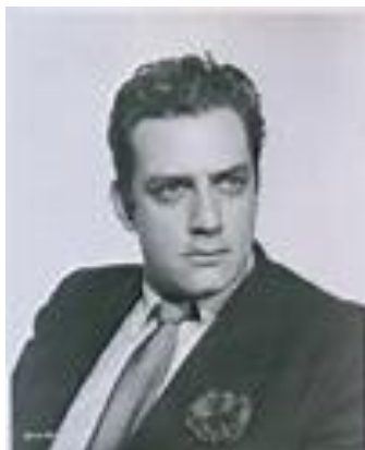
Raymond Burr, US Navy. Shot in the stomach on Okinawa and medically discharged.