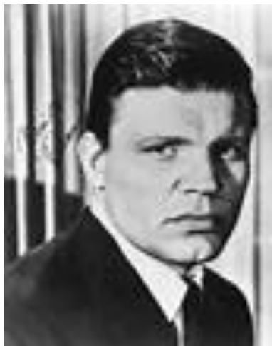
Neville Brand, US Army, Europe. Was awarded the Silver Star and Purple Heart..