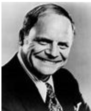
Don Rickles, US Navy aboard USS Cyrene.