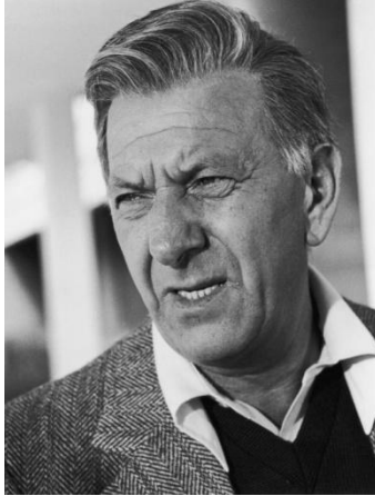
Jack Klugman, US Army.