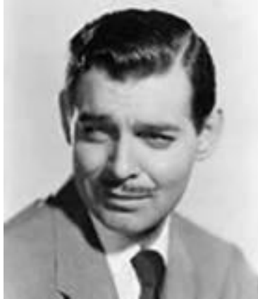
Clark Gable, US Army Air Corps. B-17 gunner over Europe.