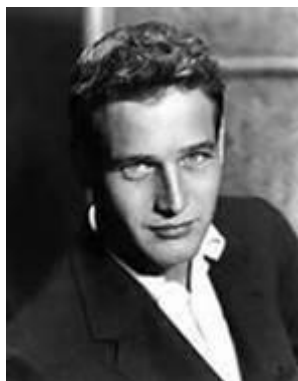
Paul Newman, US Navy Rear seat gunner/radioman, torpedo bombers of USS Bunker Hill.