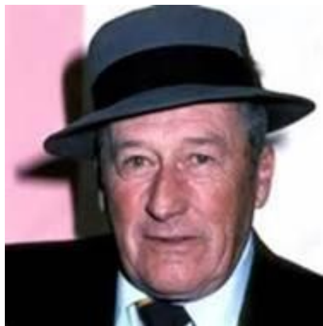
Mickey Spillane, US Army Air Corps, Fighter Pilot and later Instructor Pilot.