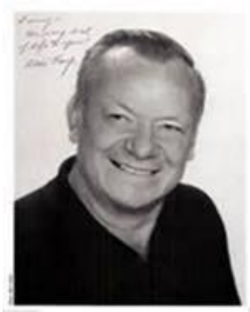
Aldo Ray. US Navy. UDT frogman, Okinawa.