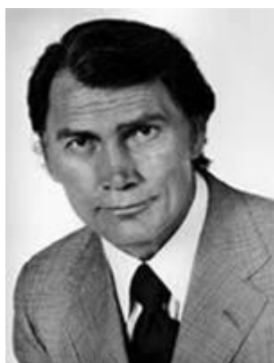
Jack Palance, US Army Air Corps. Severely injured bailing out of a burning B-24 bomber.