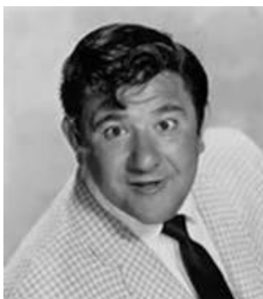
Buddy Hackett, US Army anti-aircraft gunner.