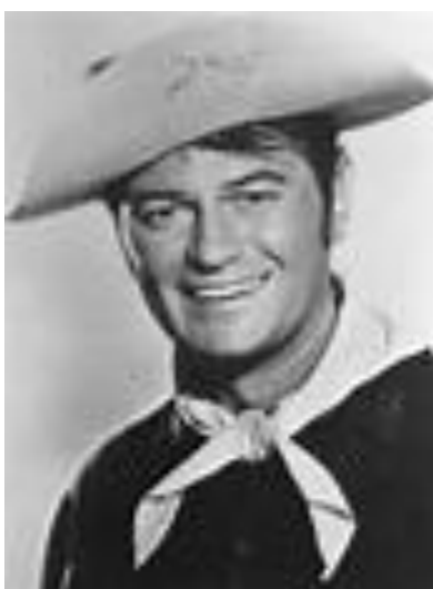
Larry Storch. US Navy. Sub tender USS Proteus with Tony Curtis.