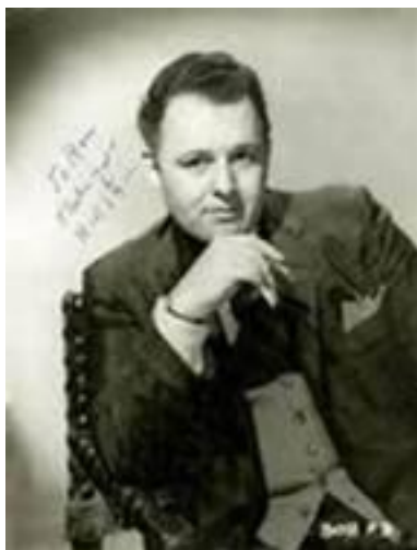
Rod Steiger, US Navy. Was aboard one of the ships that launched the Doolittle Raid.