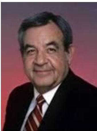
Tom Bosley, US Navy.