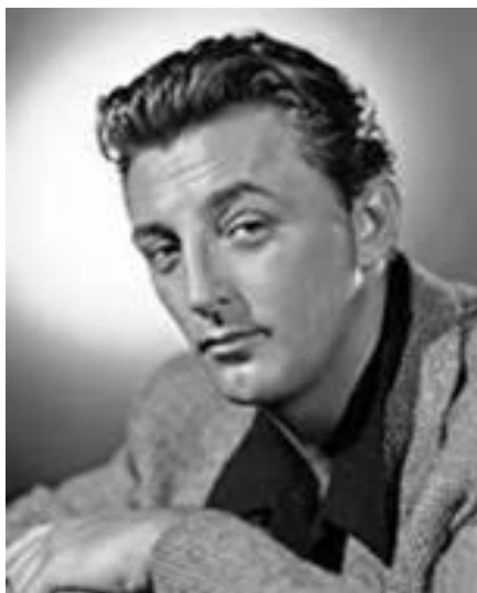
Robert Mitchum, US Army.