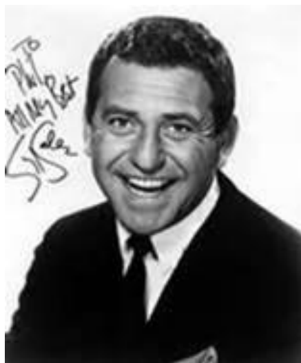
Soupy Sales, US Navy. Served on USS Randall in the South Pacific.