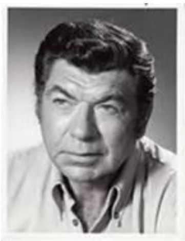
Claude Akins, US Army. Signal Corps., Burma and the Philippines.