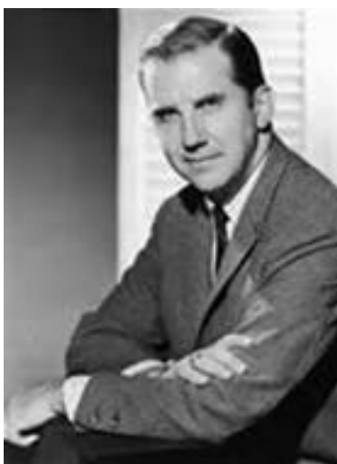
Ed McMahon, US Marines. Fighter Pilot. (Flew OE-1 Bird Dogs over Korea as well.)