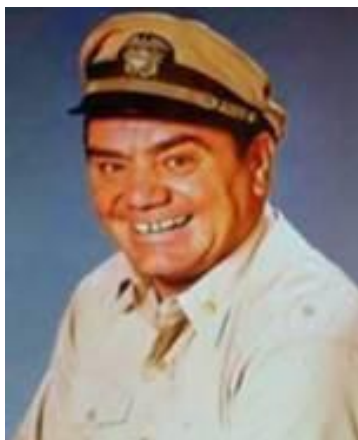
Ernest Borgnine, US Navy. Gunners Mate 1c, destroyer USS Lamberton.