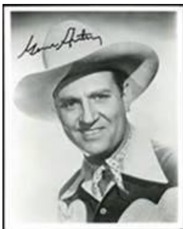
Gene Autry, US Army Air Corps. Crewman on transports that ferried supplies over "The Hump" in the China-Burma-India Theater.