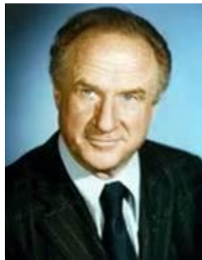
Jack Warden, US Navy, 1938-1942, then US Army, 1942-1945.. 101st Airborne Division.