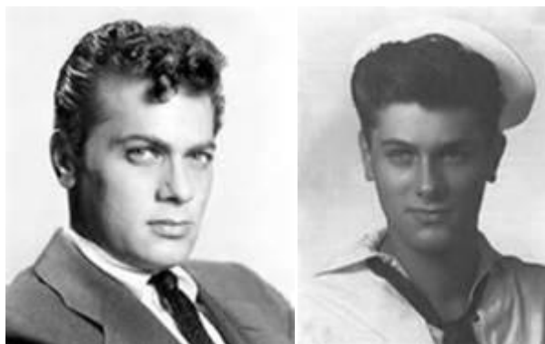
Tony Curtis, US Navy. Sub tender USS Proteus. In Tokyo Bay for the surrender of Japan.