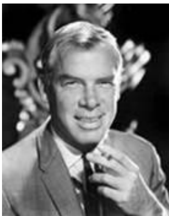
Lee Marvin US Marines. Sniper. Wounded in action on Saipan.. Buried in Arlington National Cemetery, Sec. 7A next to Greg Boyington and Joe Louis.