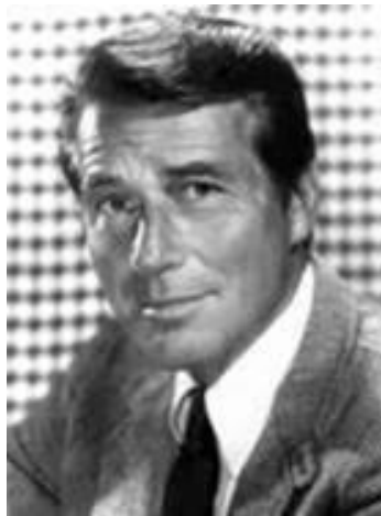
Efram Zimbalist, Jr., US Army. Purple Heart for a severe wound received at Huertgen Forest.