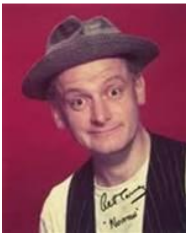
Art Carney, US Army. Wounded on Normandy beach, D-Day.. Limped for the rest of his life.