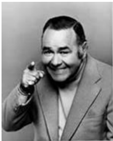
Jonathan Winters, USMC. Battleship USS Wisconsin and Carrier USS Bon Homme Richard.. Anti-aircraft gunner, Battle of Okinawa.