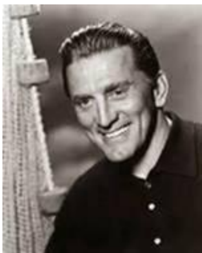
Kirk Douglas, US Navy. Sub-chaser in the Pacific. Wounded in action and medically discharged.