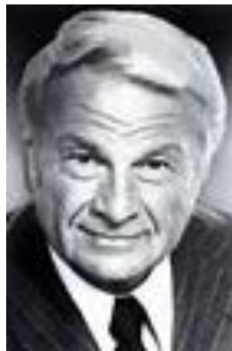
Eddie Albert, US Coast Guard. Bronze Star with Combat V for saving several Marines under heavy fire as pilot of a landing craft during the invasion of Tarawa.