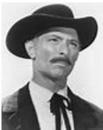
Lee Van Cleef, US Navy. Served aboard a sub chaser then a mine sweeper.