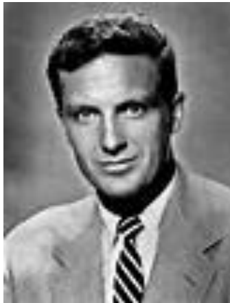
Robert Stack, US Navy. Gunnery Officer.