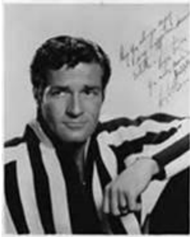
Hugh O'Brian, US Marines.