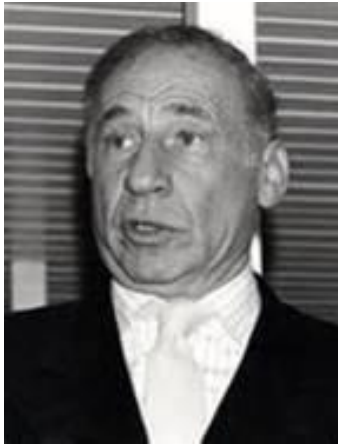
Mel Brooks, US Army. Combat Engineer. Saw action in the Battle of the Bulge.