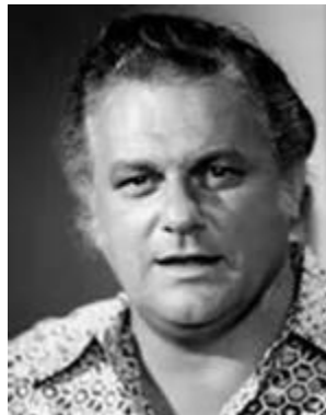
Charles Durning. US Army. Landed at Normandy on D-Day.. Shot multiple times. Awarded the Silver Star and Bronze Star and three Purple Hearts. Survived Malmedy Massacre.