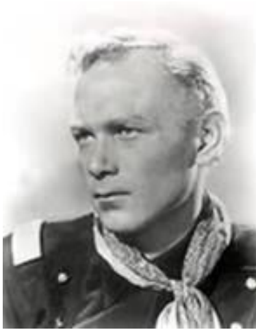
Harry Carey Jr., US Navy.