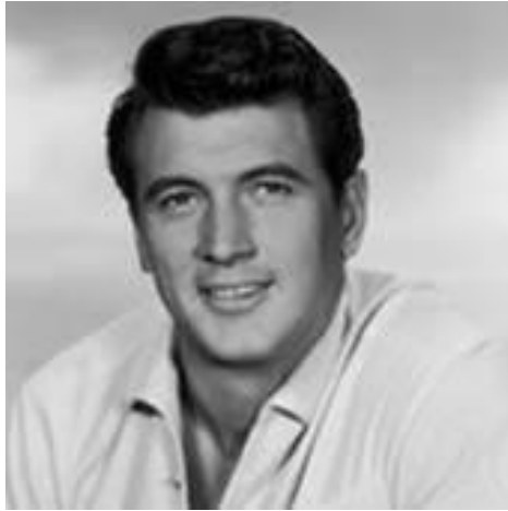
Rock Hudson, US Navy. Aircraft mechanic, the Philippines.