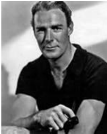
Randolph Scott. Tried to enlist in the Marines but was rejected due to injuries sustained in US Army, World War 1.