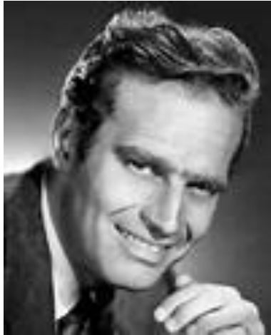
Charlton Heston, US Army Air Corps. Radio operator and aerial gunner on a B-25, Aleutians..