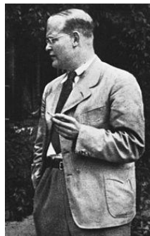
Bonhoeffer in 1939