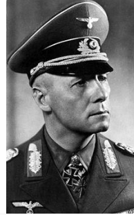
Australian troops (left) occupy a front line position at Tobruk. Field Marshal Erwin Rommel in 1942