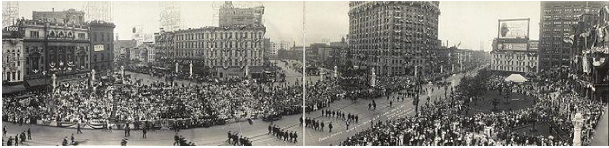
GAR Parade during the 1914 Encampment in Detroit, Michigan