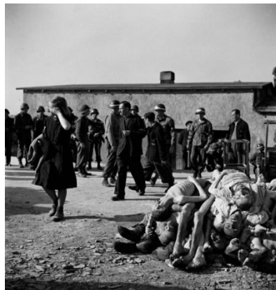
German civilians are forced by American troops to bear witness to Nazi atrocities at Buchenwald concentration camp, mere miles from their own homes, April 1945.