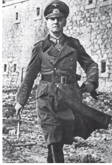
German general Erwin Rommel arrival in the desert in early 1941