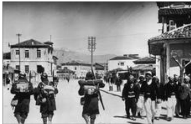
Three Albanian soldiers in an unidentified location fleeing North with peasants towards Yugoslavia